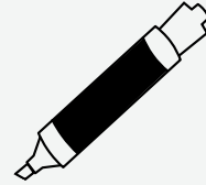
dry erase marker